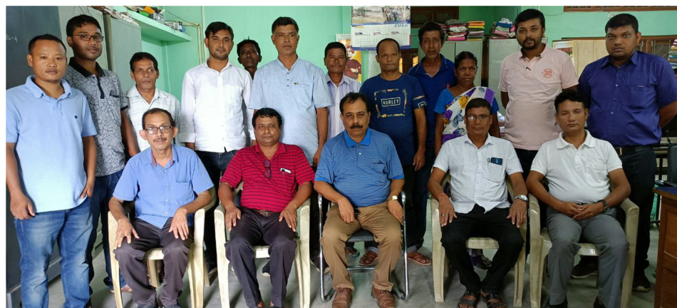
Non-teaching Staff with Principal