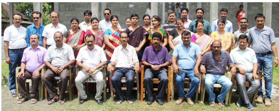
Teaching Staff with Principal